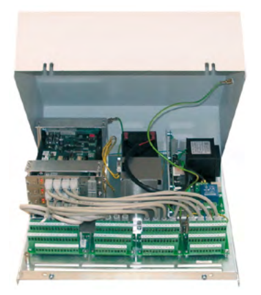
Basic unit III, with wall-mounting housing, fully populated